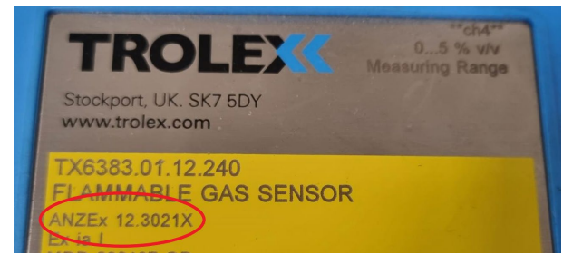
CORRECT ANZEX LABEL